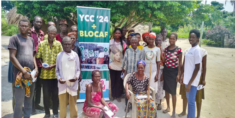
Image 2: Building Lobbying Capacity of Climate Affected Farmers (BLOCAF)

BLOCAF culminated in practical lobbying and advocacy training activities where participants can know how to directly engage with local government officials, presenting their findings and lobbying for policies that support sustainable agricultural practices. This grassroots mobilization strategy will empower Klotekpo's farmers to amplify their voices, ensuring they are heard in policy discussions that affect their livelihoods and the environment. By fostering collaboration and building coalitions within the community, Beelieve Smart is helping to create a resilient network of advocates who are committed to driving meaningful change in their local context.